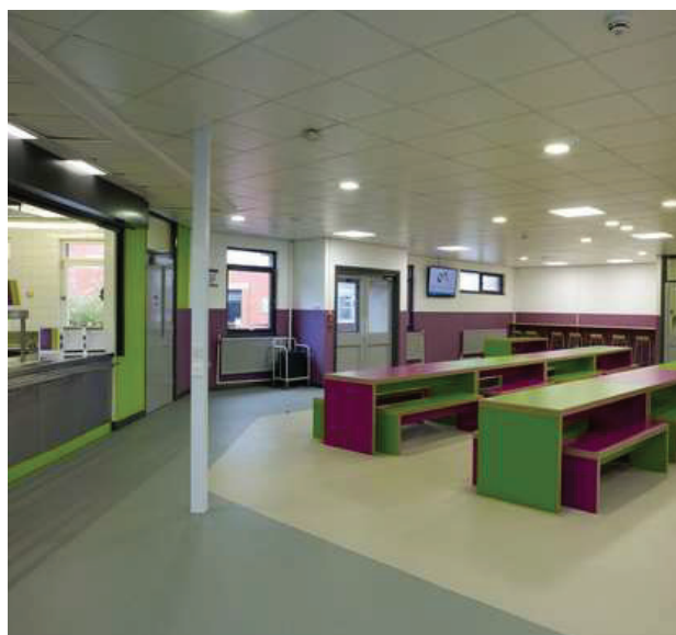
Figure 1 Polysafe Verona PUR