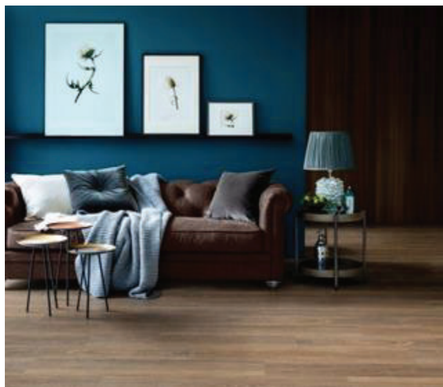
Figure 1 Expona Superplank LVT