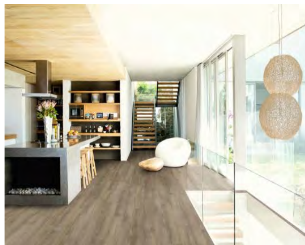
Figure 1 Expona Domestic LVT