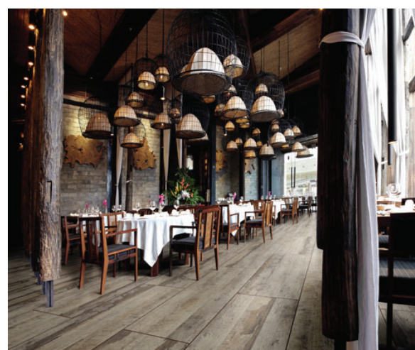
Figure 1 Expona Commercial LVT