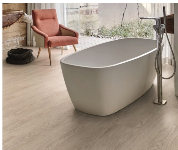
Figure 1 Affinity LVT