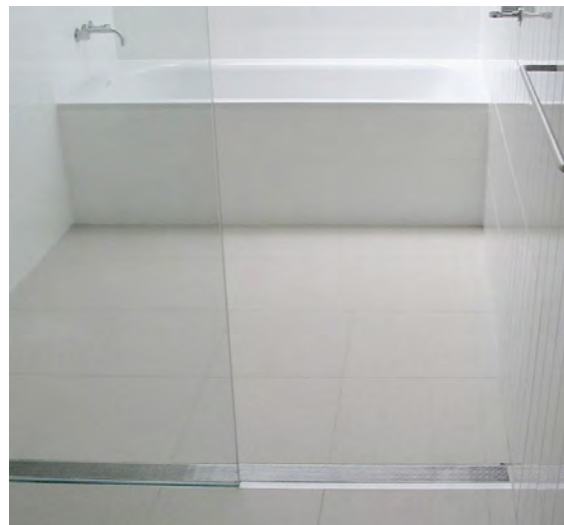
Figure 1 Slimline Stainless Steel Interior Drain