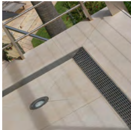
Figure 1 Slimline Manifold Drain