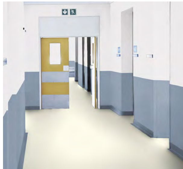
Figure 1 ProtectWall 1.5