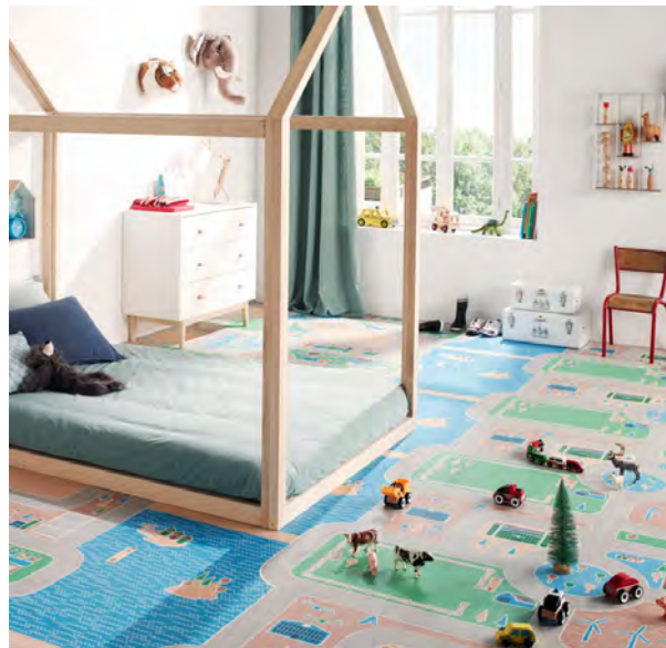
Figure 1 Exclusive 300