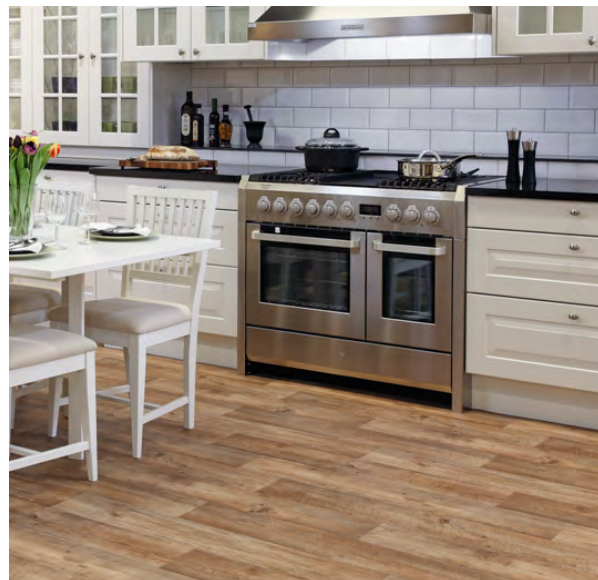
Figure 1 Essentials 300