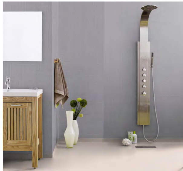
Figure 1 Aquarelle Wall HFS