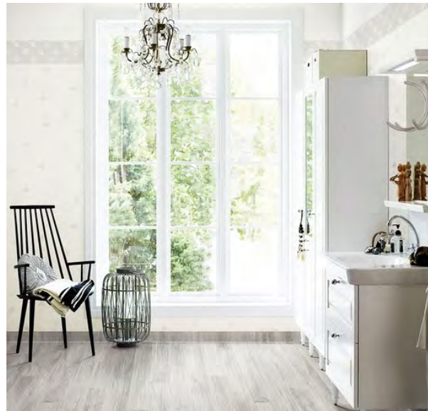
Figure 1 Aquarelle Wall & Borders