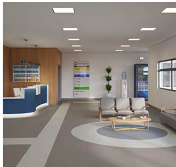
Figure 1 iQ One