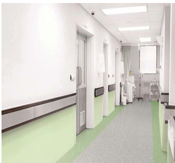
Figure 1 Homogeneous Medistep Origin®