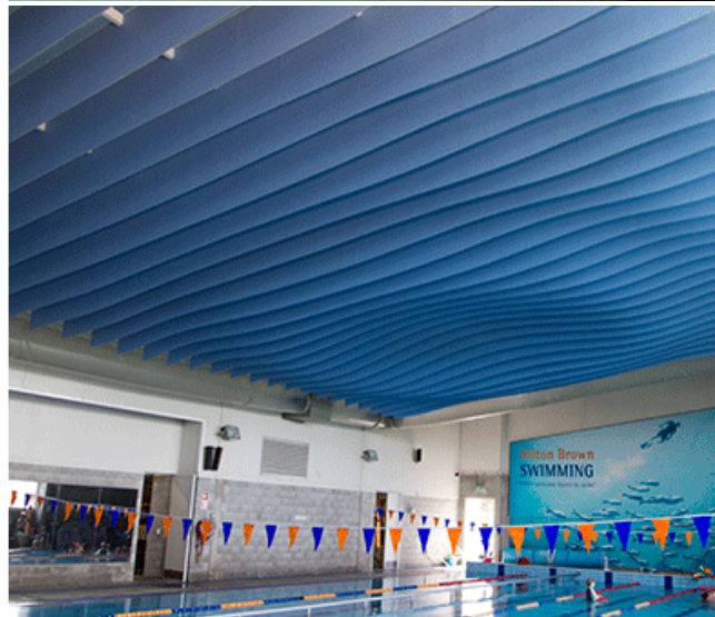
Figure 1 Workstation acoustic panels