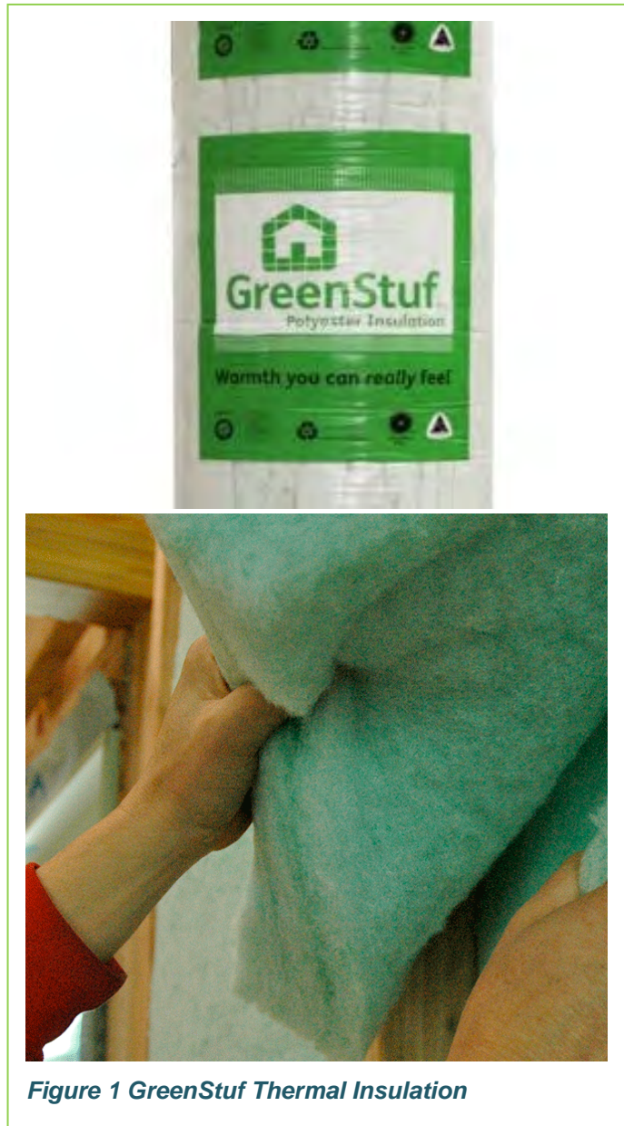
Figure 1 GreenStuf Thermal Insulation

More information is at http://www.autexindustries.com/