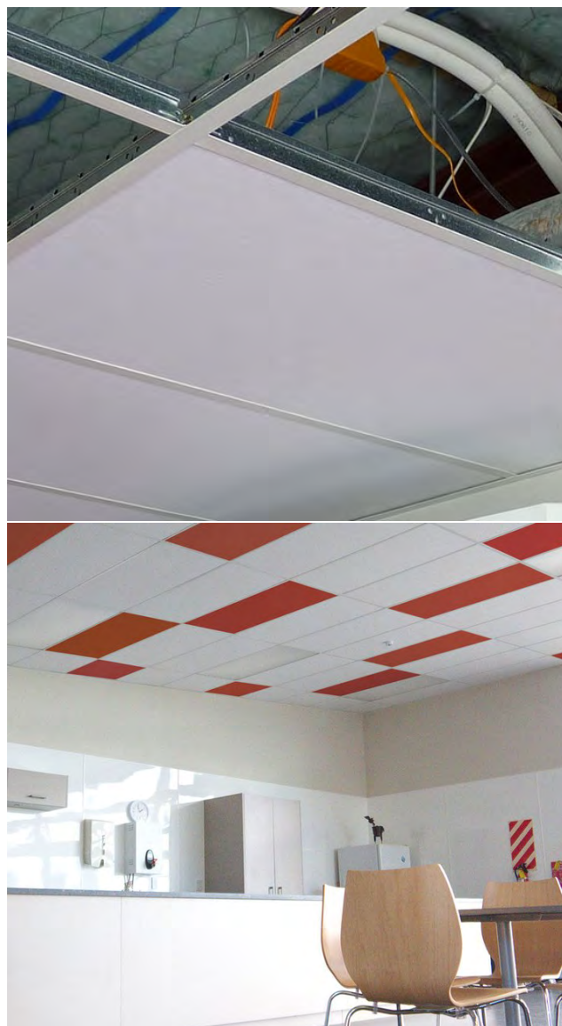
Figure 1 Quietspace Ceiling Tile

More information is at http://www.autexindustries.com/