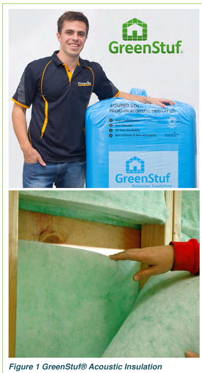
Figure 1 GreenStuf® Acoustic Insulation

More information is at http://www.autexindustries.com/