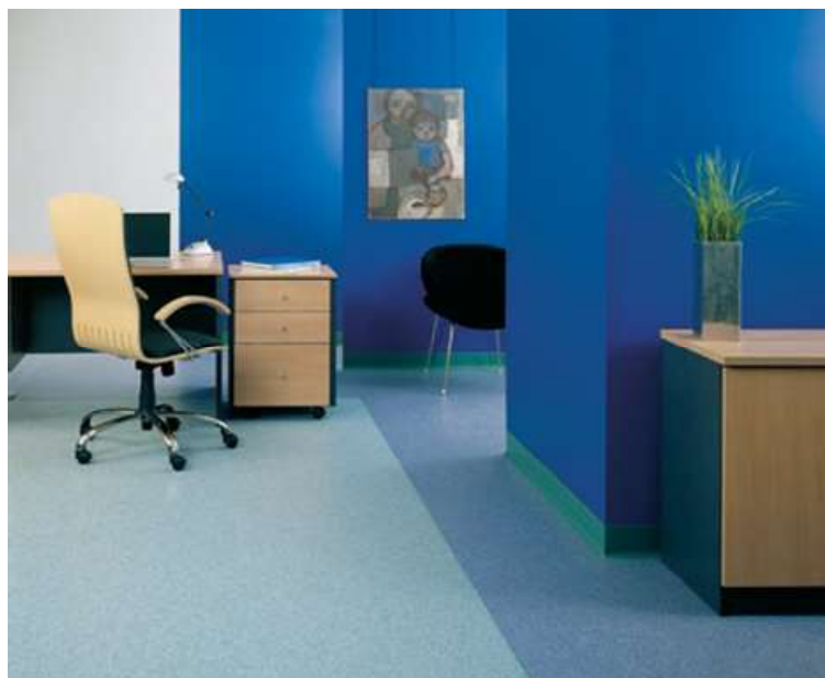
Figure 1 Accolade Plus