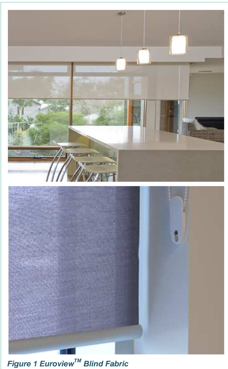
Figure 1 Euroview™ Blind Fabric

The Australian Vertilux blind and window covering manufacturer began in 1976.