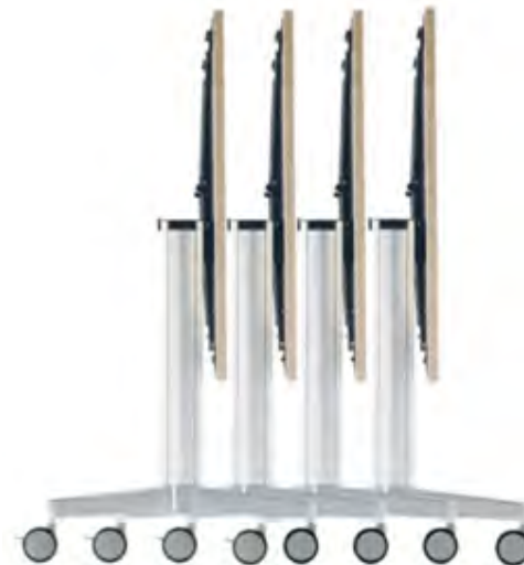
Figure 1 Moveo Training Table Base