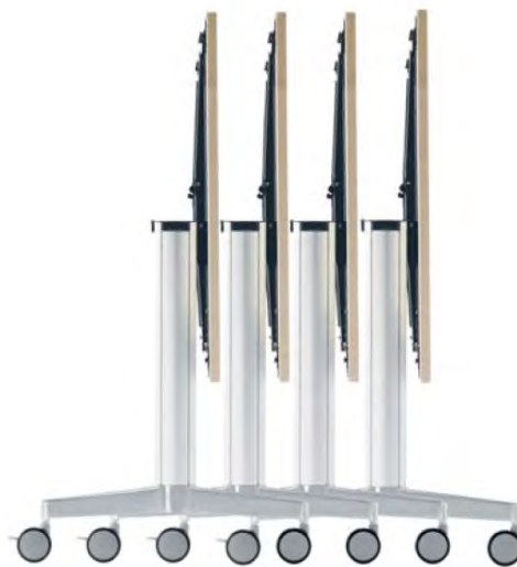
Figure 1 Moveo Meeting Table Base