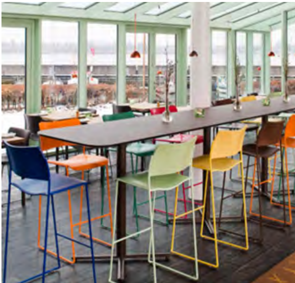
Figure 1 40/4 Veneer Barstool