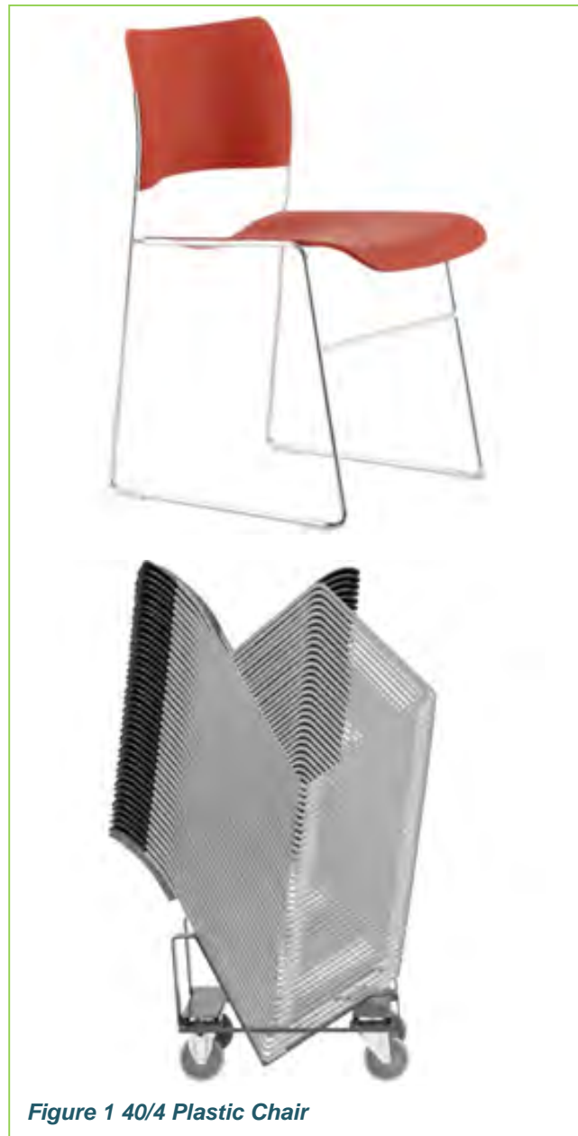
Figure 1 40/4 Plastic Chair

More information is at http://www.howe.com/