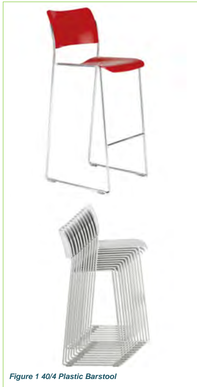
Figure 1 40/4 Plastic Barstool

More information is at http://www.howe.com/