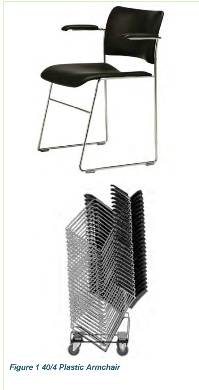
Figure 1 40/4 Plastic Armchair

More information is at http://www.howe.com/