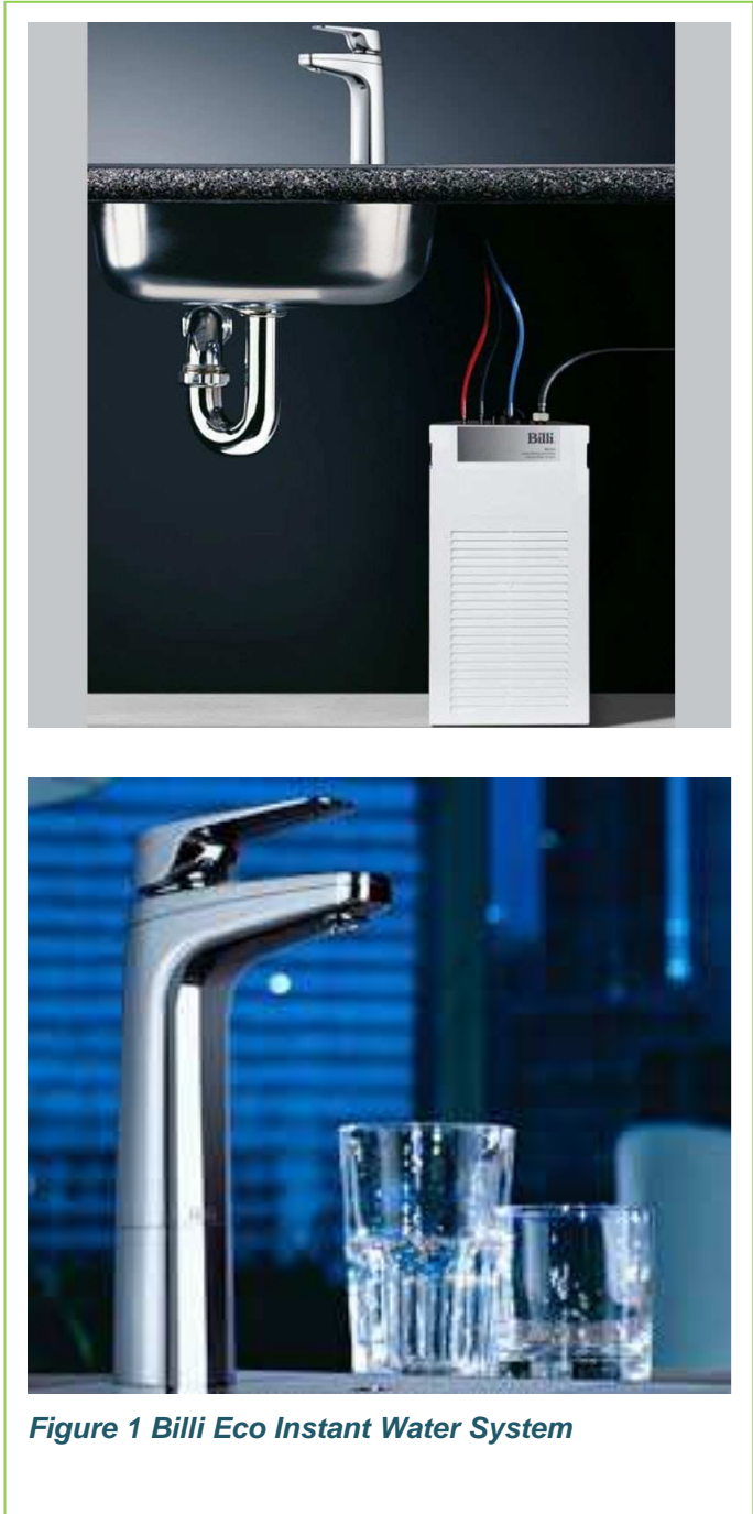
Figure 1 Billi Eco Instant Water System

Billi is an Australian manufacturer and supplier of high quality drinking water kitchen and washroom systems. Their products were first launched in the market in the early 1990s. Billi invests in innovation and design and has a policy of continuous improvement. With every new design, Billi aims to continue to improve eco-technology features. In 2013 their water system has received the Premier's Design Award. The Billi Eco, Quadra and Quadra Plus systems offer combined boiling and chilled water functions. Systems are designed for small use (1-10 users) or for bigger use (20-280 users). All Billi filter systems are tested to Victorian Electrical Safety Act 1998, AS/NZS ISO 9002, AS1428 Accessibility Design Requirements, and CTick approved. All Billi Eco, Quadra, and Quadra Plus systems do also comply with Watermark AS3498 as well as AS/NZS 4020 standards. More information is at http://www.billi.com.au/