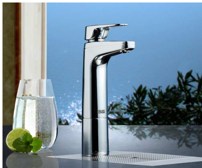
Figure 1 Billi Quadra Instant Water System