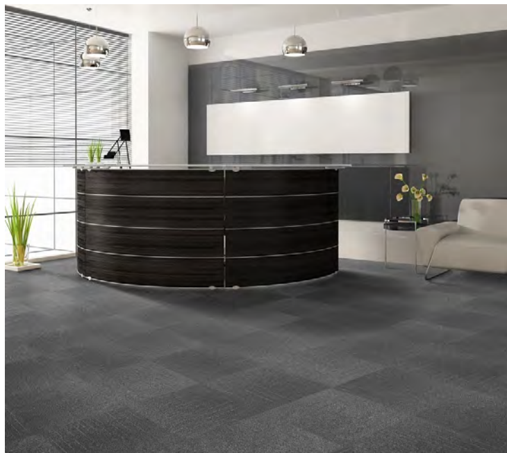
Figure 1 Belgotex SDX Tufted Carpet Tiles

Belgotex Floors is a South African manufacturer serving a worldwide soft flooring export market.