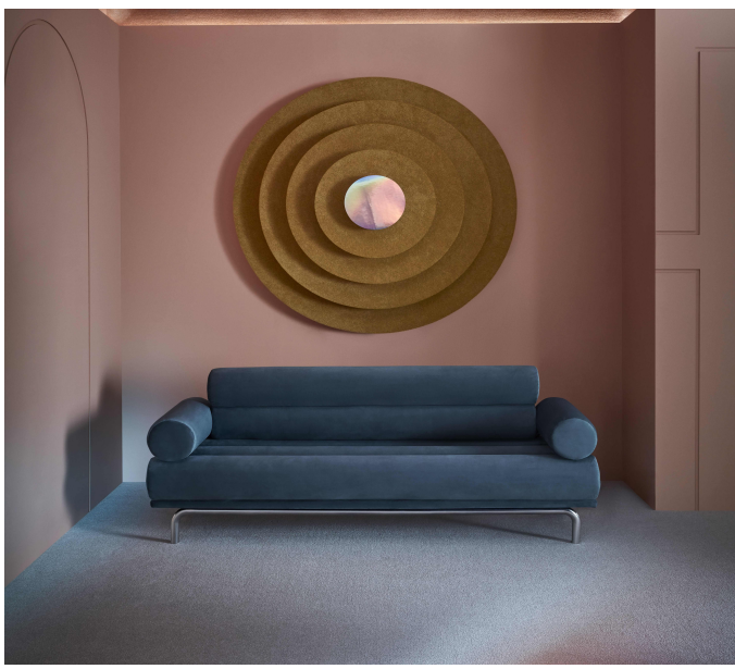
Figure 1 SDN Tufted Broadloom Carpet

Belgotex is a leading South African carpet and artificial grass manufacturer.