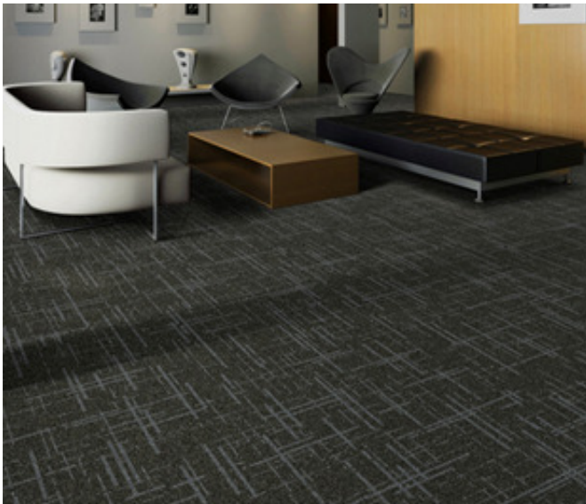
Figure 1 SDN Tufted Broadloom Carpet

Belgotex is a leading South African carpet and artificial grass manufacturer.