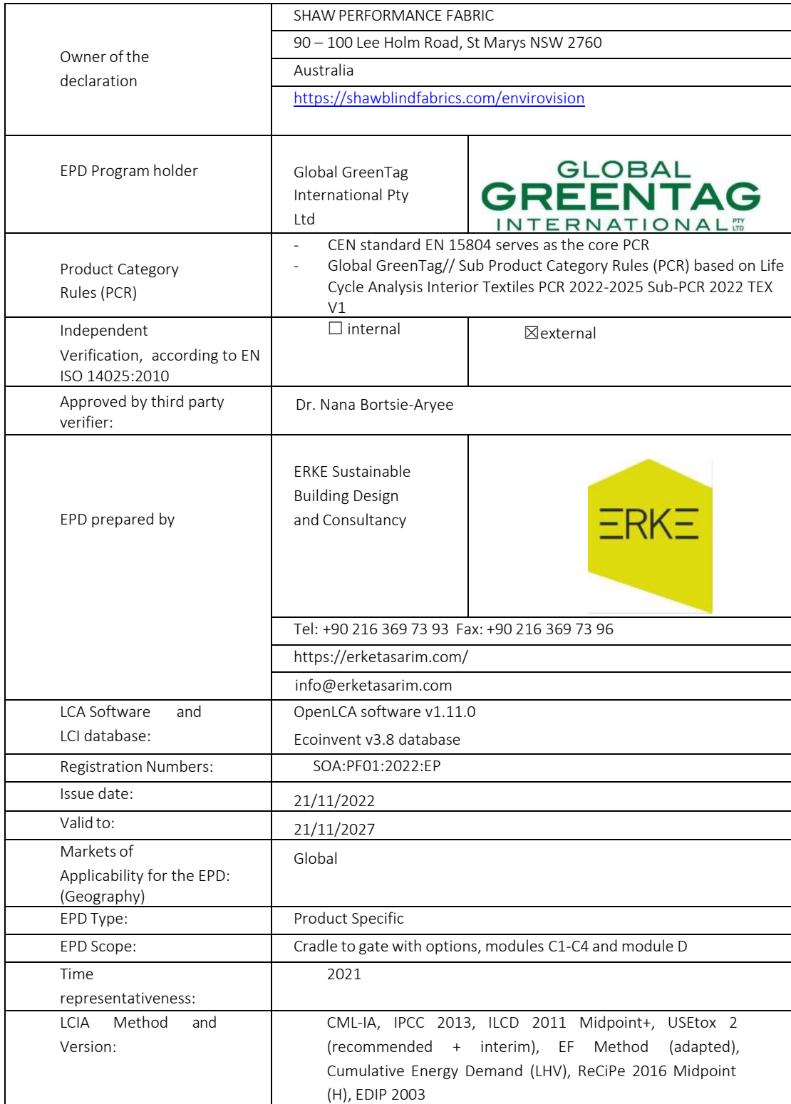
Table 1. General information of EPD program