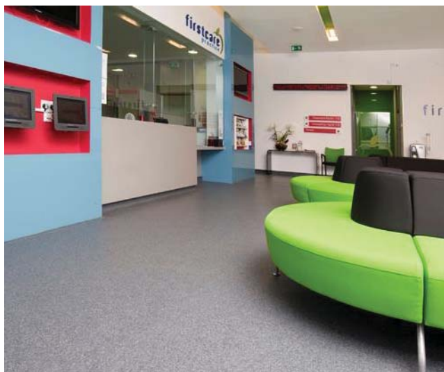
Figure 1 Homogeneous Classic Mystique PUR