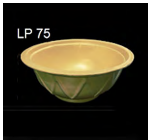
Figure 1 ECOBOX® disposable food LP: 32 and 75 bowls