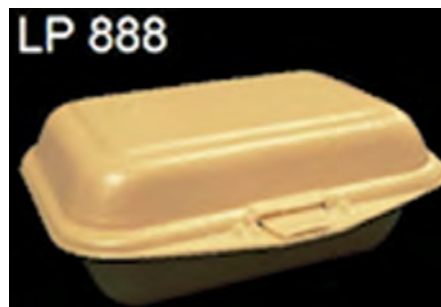
Figure 1 The Covered Lunch Boxes