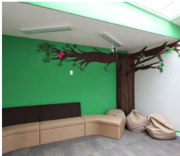
Figure 1 Vertiface Acoustic Fabric