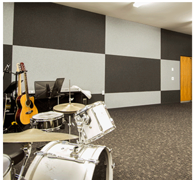
Figure 1 Cube Acoustic Panels