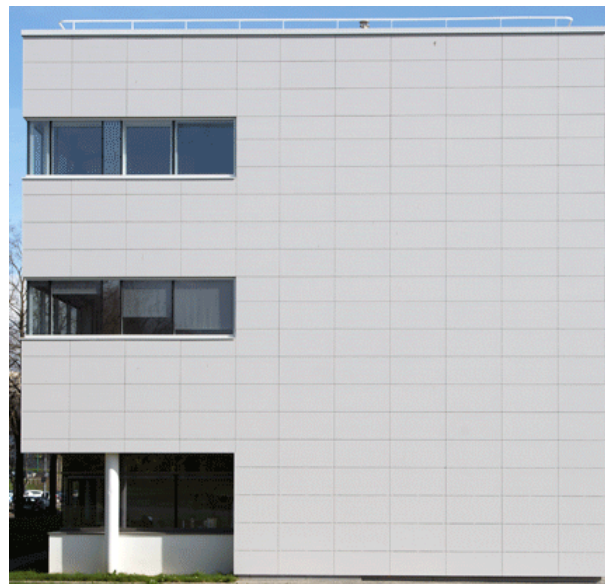
Figure 1 Porcelanosa STON-KER Façade Tiles