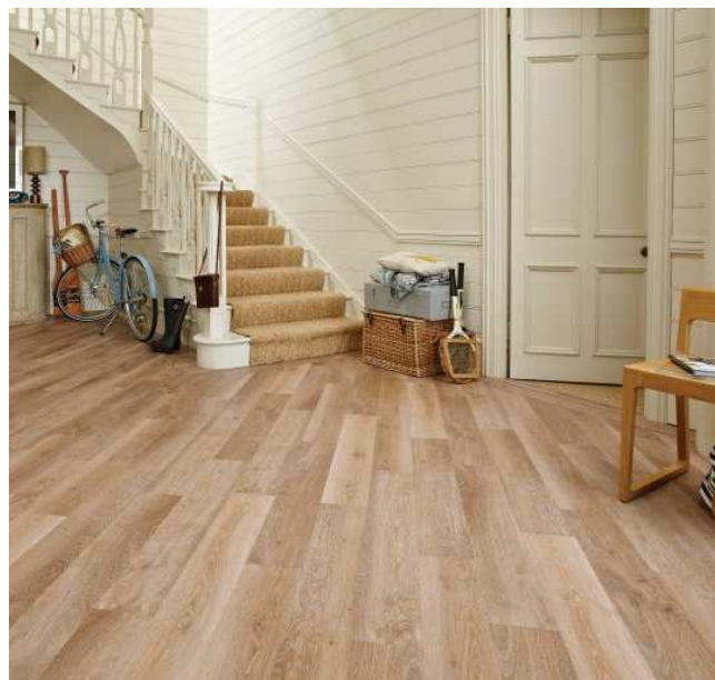
Figure 1 Karndean Van Gogh Luxury Vinyl Tile