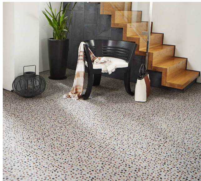
Figure 1 Karndean Michelangelo Luxury Vinyl Tile