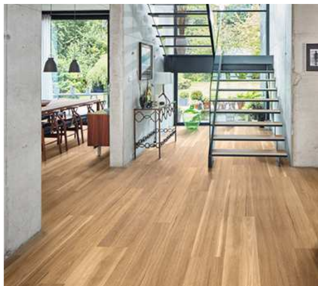
Figure 1 Karndean Knight Luxury Vinyl Tile