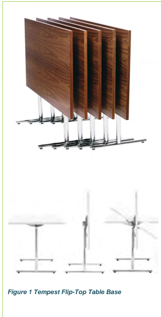
Figure 1 Tempest Flip-Top Table Base

More information is at http://www.howe.com/