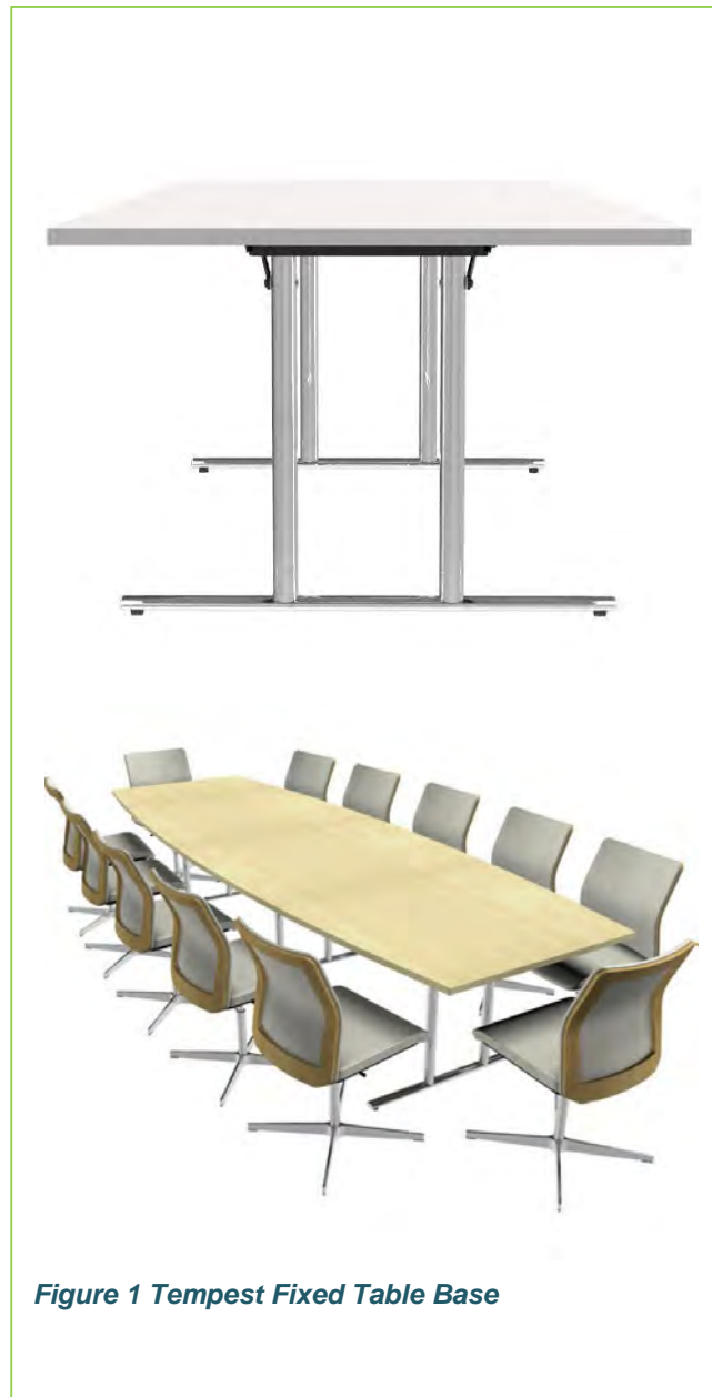
Figure 1 Tempest Fixed Table Base

More information is at http://www.howe.com/