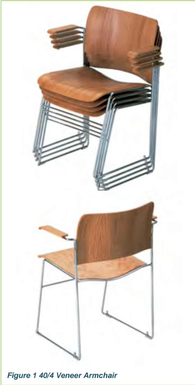
Figure 1 40/4 Veneer Armchair

More information is at http://www.howe.com/