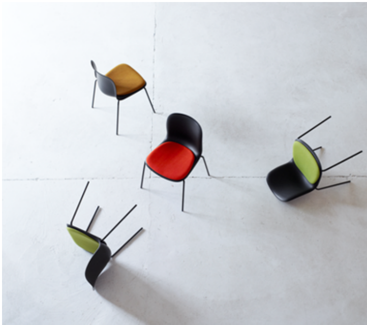
Figure 1 HOWE SixE Sidechair Upholstery

HOWE is an innovative Danish company and a pioneer in design and development of multifunctional and space-saving furniture solutions.