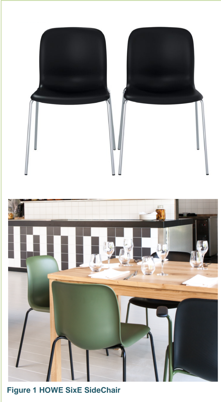
Figure 1 HOWE SixE SideChair

HOWE is an innovative Danish company and a pioneer in design and development of multifunctional and space-saving furniture solutions.